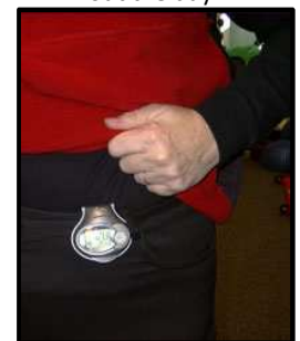
The BioTrainer: Measures activity through the day.