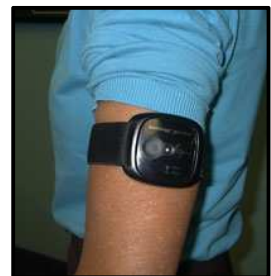
The BodyBug: Measures activity, exertion, and calories burned throughout the day.

We've been busy testing the latest technology involved in improving and maintaining a healthy activity and weight level. As we get more experience with these technologies, we'll give you an update of how they're working and which ones we recommend.