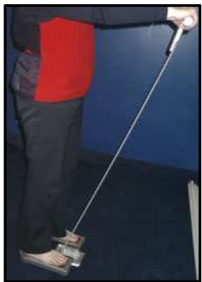
Omron Body Composition Monitor & Scale: Measuring body composition and weight

Start off this year right by reforming your health - make a commitment to do all you can to make your body work for you – to do what you want to do, now and in the future.